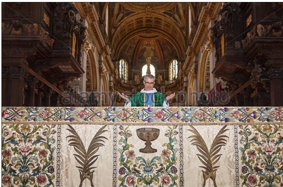
St Paul's Altar Frontal post WW1 - see article pp 12 and 13